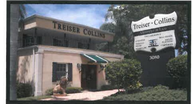
Southeast of the Collier County Government Complex at Airport Road and U.S. 41 East, Naples, FL